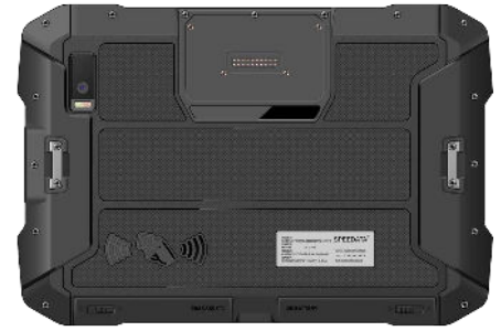
backside of the SD100 Orion Plus