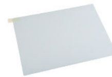
RT10-SCREEN-FILM1 (Available late Q4, 2020)

Smart card reader. Snaps on to the back of the tablet.