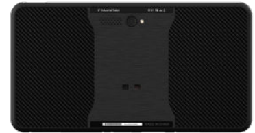
back of the FG80