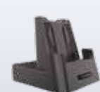
94A150095 Single Slot Charging Dock