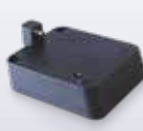
Ethernet Adaptors (Single: 94ACC0297 / Triple: 94ACC0288)