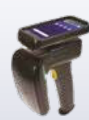
DLR-SLED01-EU RFID Reader Sled