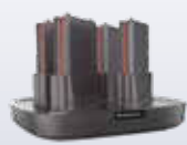
94ACC0192 4-slot Battery Charging Dock