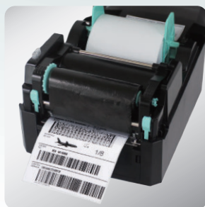
Uses standard low-cost labels and ribbons