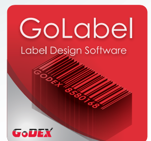
Free labeling software GoLabel for easy printing