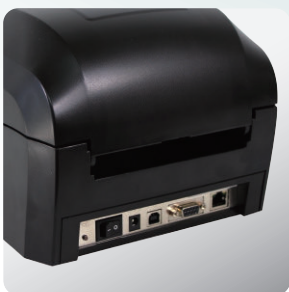
Ethernet, Serial and USB ports included

Use the GE300 for all you light to medium duty thermal transfer barcode printing applications