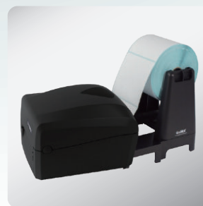
High cost-effectiveness for large amount printing